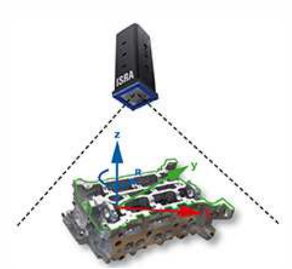
645_3.jpg Contour-based detection using a single sensor – MONO2.5D.

E-Mail: nrueffer@isravision.com Phone: +49 (6151) 948 - 192