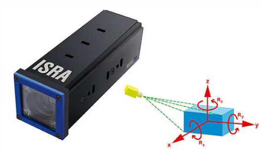
645_4.jpg 6D location determination using a single camera: Efficiency in automation.

ISRA VISION AG Industriestraße 14 64297 Darmstadt Germany