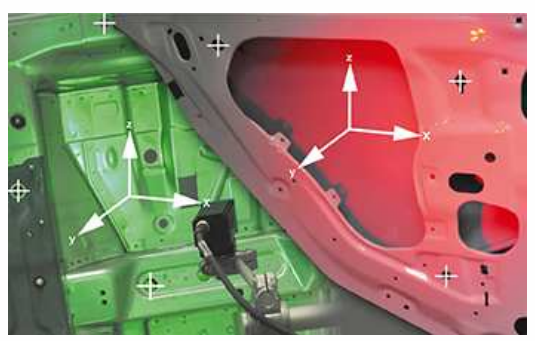
645_5.jpg MONO3D is a reliable and highly efficient solution designed to detect exact position in a three dimensional space.

E-Mail: nrueffer@isravision.com Phone: +49 (6151) 948 - 192